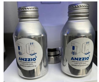
*300ml Aluminium Bottle