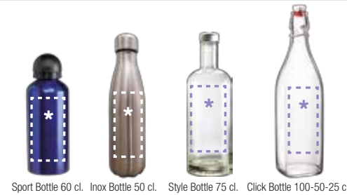
Sport Bottle 60 cl. Inox Bottle 50 cl. Style Bottle 75 cl. Click Bottle 100-50-25 cl.